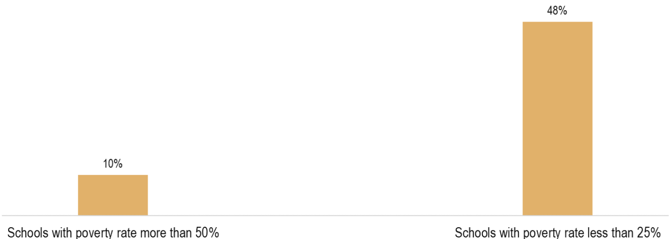
Percentage of schools with licensed librarians 2018 Economically Disadvantaged Rate